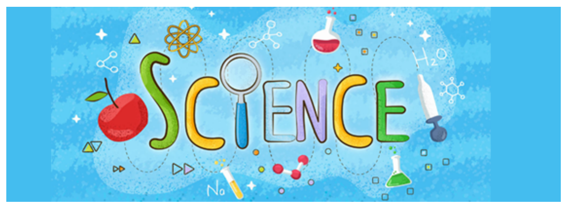
WEBINAR: Join Us – health consumers as partners in research